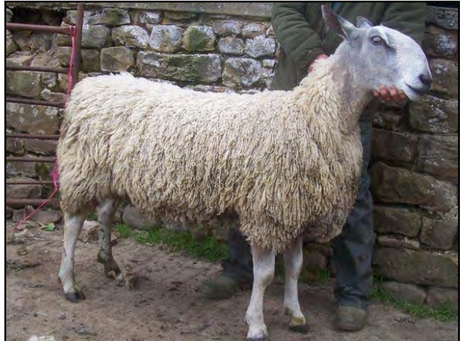
Heddon Valley 3246/X4