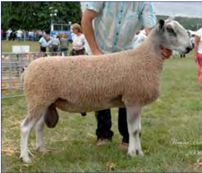
Llwygy 1706/X1 E+